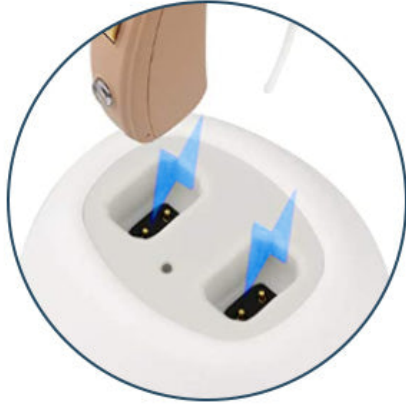
Magnetic Charging Dock