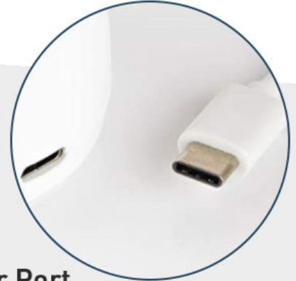
USB-C Power Port

4 Hours Fast Charge Can be Plugged in Reverse