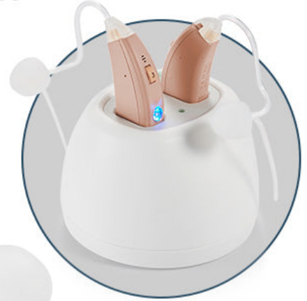
Can be Installed in Reverse